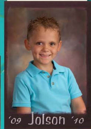
18 Photo Stickers (Actual size shown)