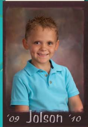
18 Photo Stickers (Actual size shown)